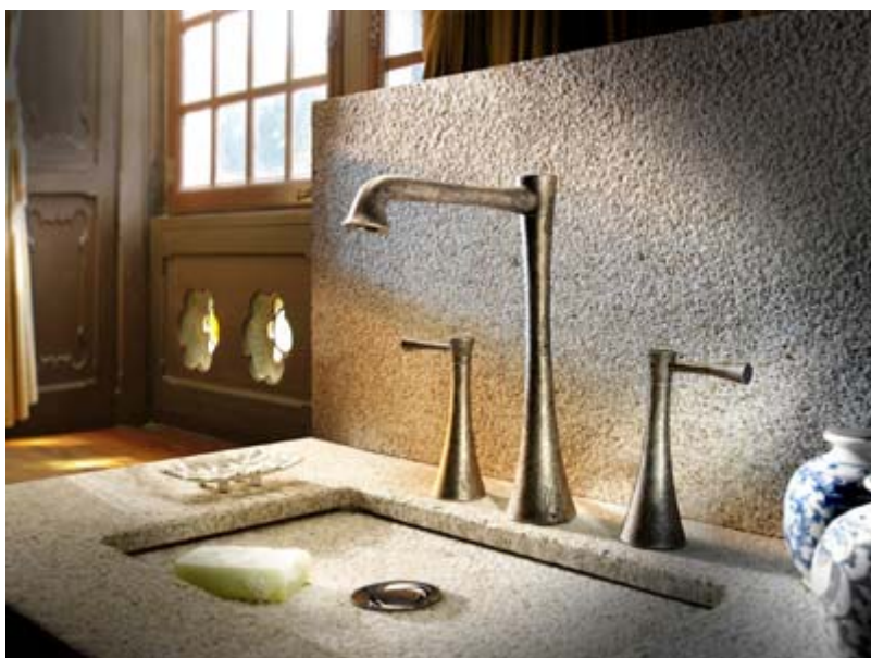
Cifial Brookhaven L-Spout Series is available in eight finishes which include three living finishes ranging from distressed bronze, rough bronze to weathered