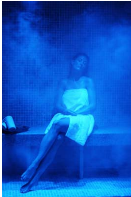
Mr. Steam ChromaSteam shower with specially formulated essences and chroma and aroma therapy

Chroma Therapy has been used for centuries for its profound holistic powers. In fact, Hippocrates (the Father of Western Medicine) incorporated Chroma and Aroma Therapy into his practice. Mr. Steam and Hansa have perfected the ancient healing arts of Chroma Therapy by harnessing the holistic powers of the rainbow. Each feature's high performance LED's that cover the entire spectrum for an uplifting or relaxing shower experience.