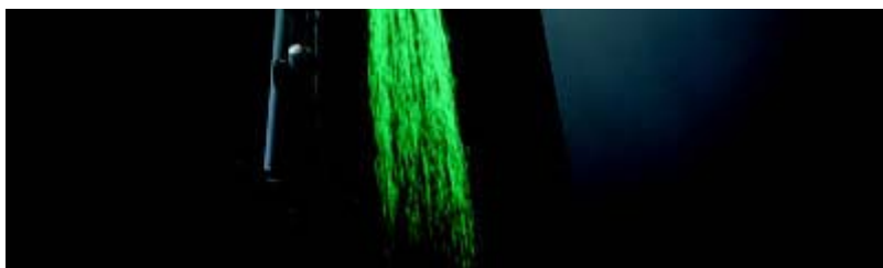
Hansa chroma therapy Hansacolourshower