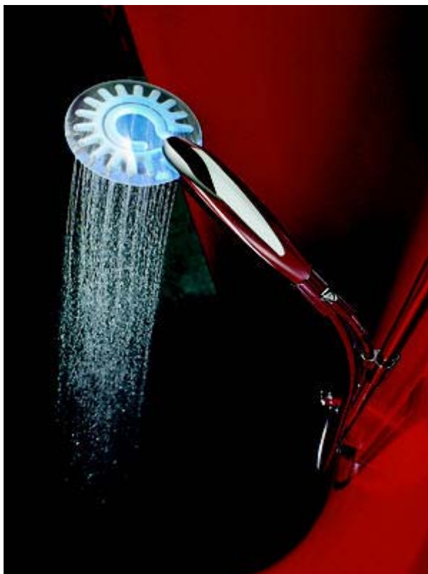
Hansaclear lux hand shower