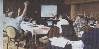
IAPMO GTC members vote to limit shower flow to 2.0-GPM in a single shower compartment.

DENVER — The Green Technical Committee of the International Association of Plumbing & Mechanical Officials