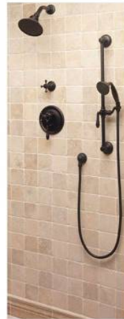
11 | The Roaring Twenties Collection of shower products from Jaclo combines a vintage aesthetic with state-of-the-art thermostatic shower valve technology. A variety of fixtures can be combined with rich finishes to provide a distinctive look. Circle No. 68 on Product Card