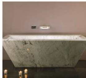
14 | Stone Forest's Rubix Bathtub is carved from a single block of Carrara Marble. It features a distinctive geometric shape, complete with tapering sides and angled corners. Circle No. 71 on Product Card