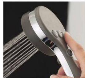
15 | The ActivTouch hand shower from Alsons Corp. features three spray-selection buttons that allow the user to select up to eight spray combinations. Other features include a 5' extendable, stainless steel hose, anti-clog nozzles and a pause-control button. Circle No. 72 on Product Card