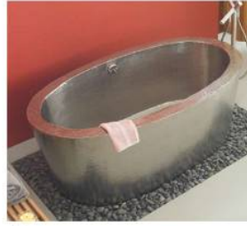
8 | Aspen, a freestanding bathtub from Native Trails, is now available in a brushed nickel finish. Hand-crafted and hammered, the oval soaking tub features a textured surface that reflects light. The double wall design and the high heat conductivity of copper maintains water temperature. Circle No. 65 on Product Card