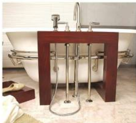
12 | The Interlude Lago tub from Six Eleven Architectural Bath Design features a base that is available in wood, color, solid stone or steel to accommodate a range of room designs. It is available with the option of HTW or hydro-therapeutic whirlpool system. Circle No. 69 on Product Card