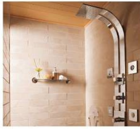
7 | Graff's Luna Family features a vessel filler, a Roman tub filler and a thermostatic shower system, all offered in either polished chrome or Steelnox satin nickel. Matching handshowers and body sprays are also available. Circle No. 64 on Product Card