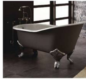
9 | The Epoque Nouveau tub from Porcher is a traditional claw-footed tub available in either a freestanding design or high-back slipper style. The tub is graced with distinctively styled feet in white or chrome and finished with white titanium enamel. The tub's exterior walls and feet may also be custom painted. Circle No. 66 on Product Card

with the morning shower or wind down with a shower or bath at the end of the day," he says.