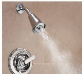
13 | Delta Faucet Co. has expanded its H2Okinetic showerhead offerings to include traditional, transitional and contemporary models. H2Okinetic Technology produces bigger water droplets at a water-saving 1.5 gallons per minute for a drenching shower. Circle No. 70 on Product Card