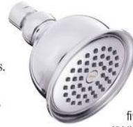
10 | Low-flow showerheads from Danze use only 1.5 gallons per minute, and are available in five decorative designs: 4" Victorian, 4" Round Sunflower, 3" Two-Function Massage, 4" Lamp Sunflower and 6" 305 Showerhead. Circle No. 67 on Product Card

Moen's iDigital offers digital command of temperature and flow, with four custom presets and one-touch activation. An optional remote control allows the user to turn on the shower from across the room.