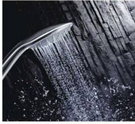
6 | The Euphoria from Grohe is the first hand shower to be fitted with the company's SprayDimmer – a small lever that allows the user to control the water flow with one finger. The fitting has a rainshower design with spray options including Massage spray, Champagne spray or Pure spray. Circle No. 63 on Product Card